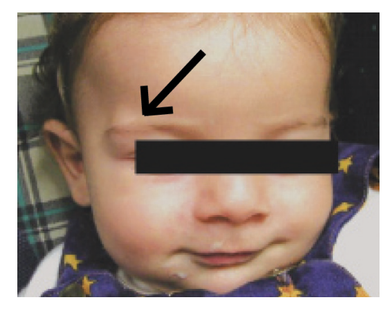
Typical dermoid around right eye

Once the operation has finished, your child will be taken to the recovery area. When they are awake, you will be called into the recovery ward. Often children appear distressed and a little confused initially - there may be several reasons for this including residual effects of the anaesthetic, hunger, and some discomfort. Generally they will settle quite quickly, especially if offered a drink or feed. The recovery and ward staff are also able to give additional