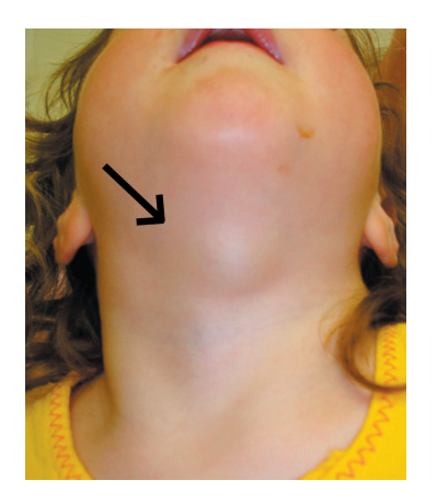
Thyroglossal Duct Cyst

The aim of the surgery is to remove the entire cyst. In the case of the thyroglossal duct cyst, any potentially remaining communication between the cyst and the back of the tongue will be removed with the middle portion of a small bone in the neck called the hyoid bone. There should be no long-term problems from removing this piece of bone. The procedure typically takes between 30 minutes and one hour and is performed under a general anaesthetic.